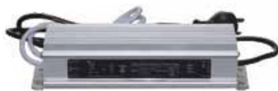
Driver 24W-250W 12V/24V driver